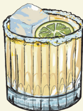
CALAMANSI MARGARITA 10.0