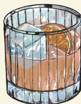
MILO OLD FASHIONED 9.0

Maker's Mark milo syrup orange bitters chocolate bitters