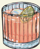
GUAVA DAIQUIRI 11.5

gin midori melon rum tequila triple sec sprite