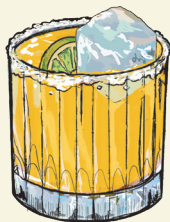
MANGO MARGARITA 10.0