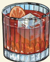
ANNATTO NEGRONI 11.0

annatto infused gin red vermouth campari orange bitters